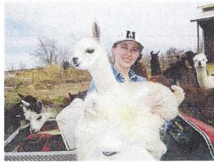
Pink Pinafore - $1800 (ARI)