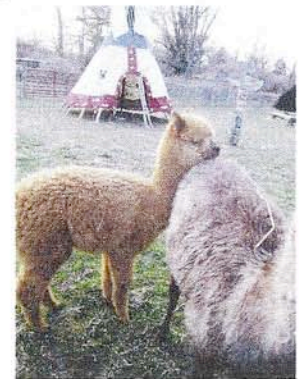
Whitman - $500

Prices include 3 months FREE boarding; halter and lead; prices do not include this year's fleeces of these animals.