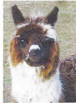
Dorothy - $1000 (CAN)